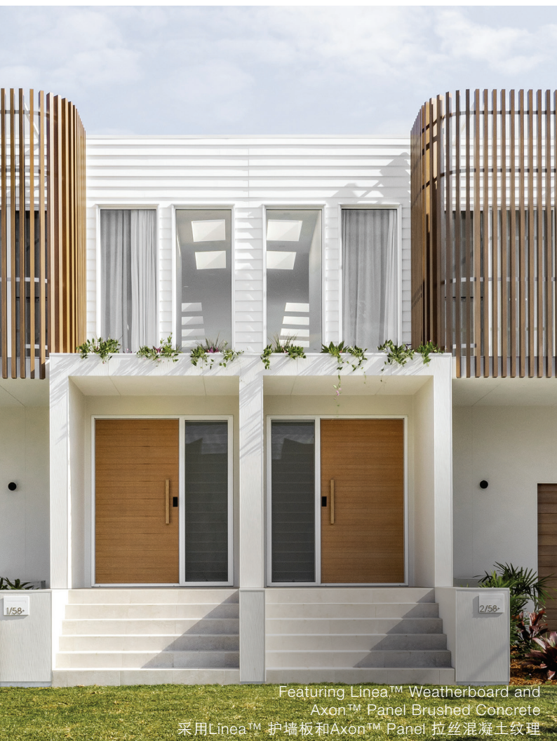
Featuring Linea™ Weatherboard and Axon™ Panel Brushed Concrete 采用Linea™ 护墙板和Axon™ Panel 拉丝混凝土纹理