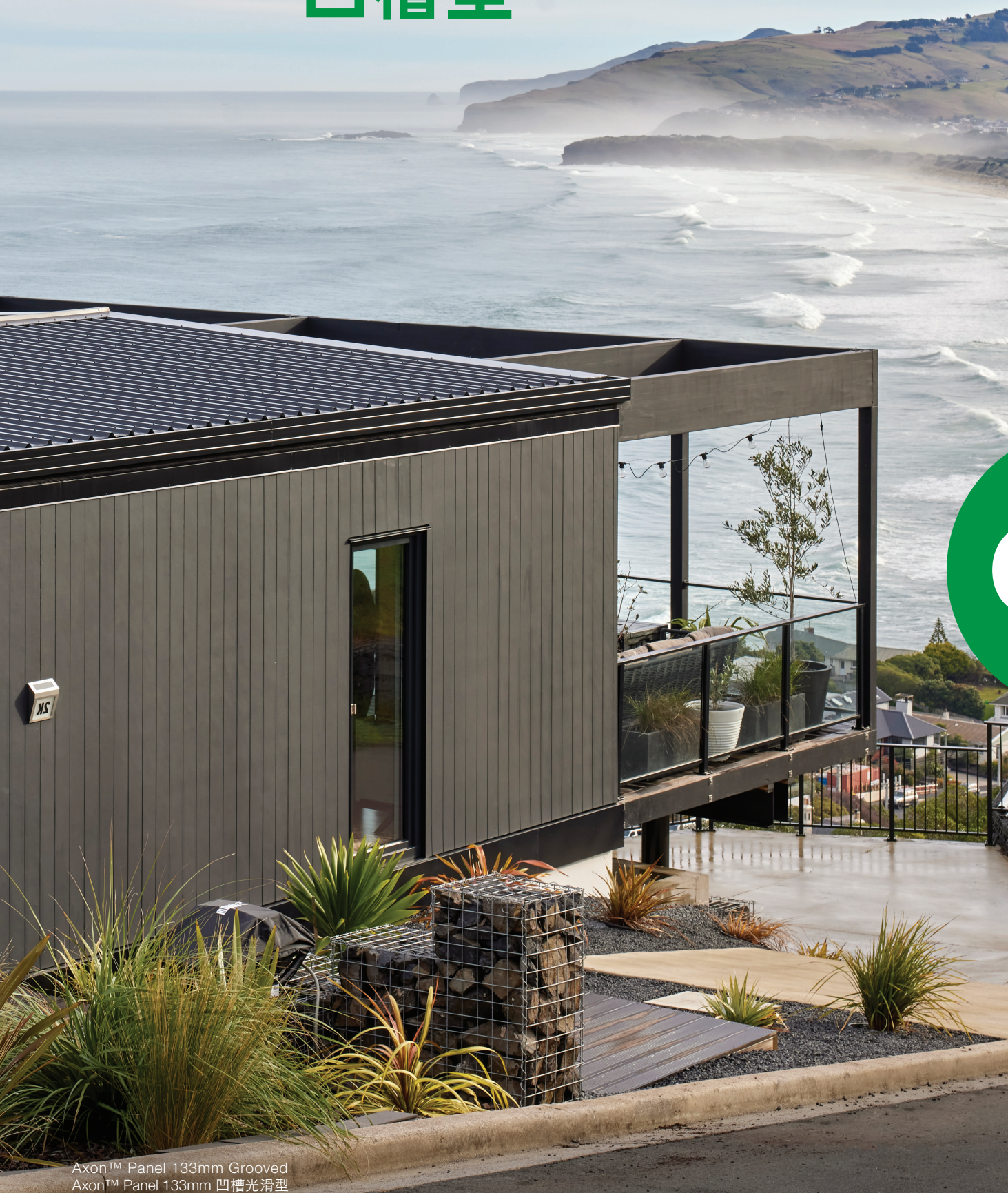
Axon™ Panel 133mm Grooved Axon™ Panel 133mm 凹槽光滑型