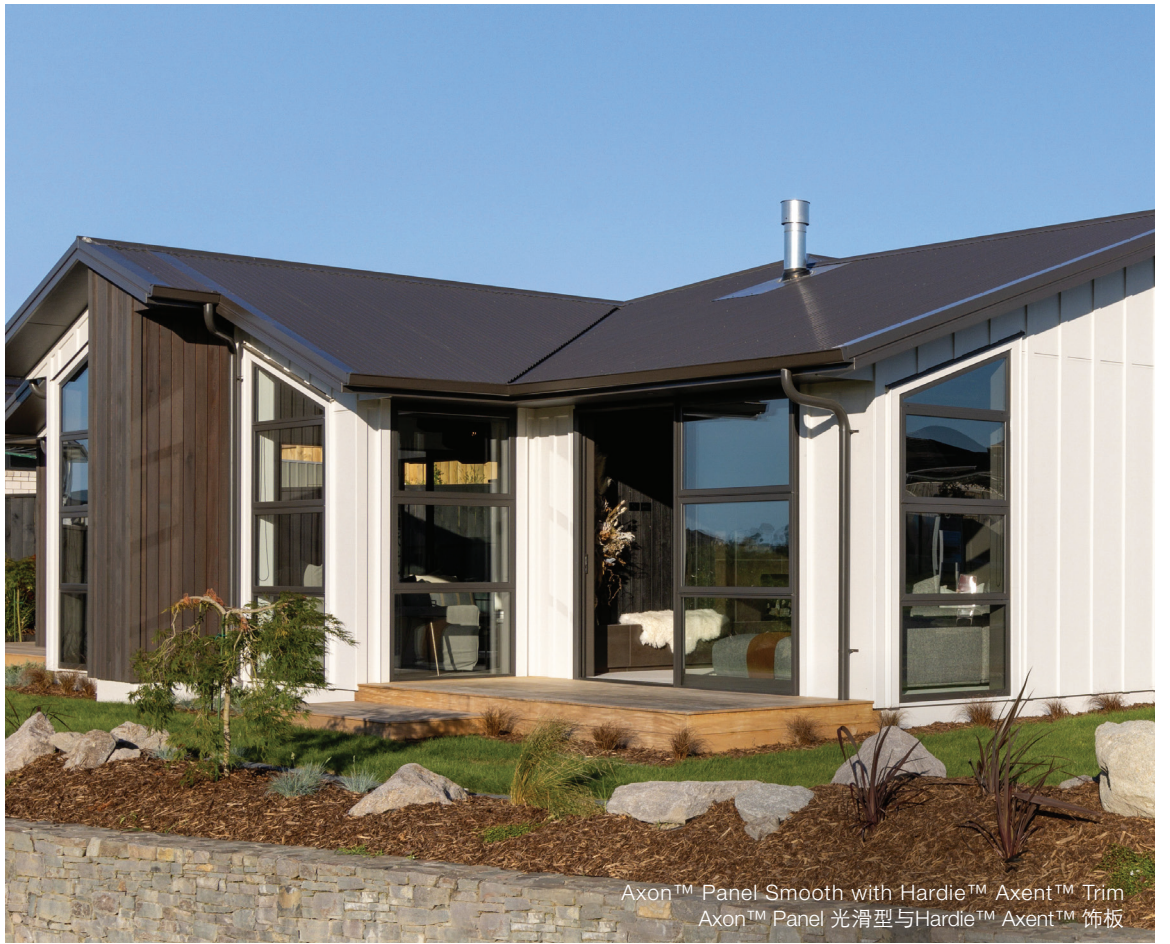
Axon™ Panel Smooth with Hardie™ Axent™ Trim Axon™ Panel 光滑型与Hardie™ Axent™ 饰板