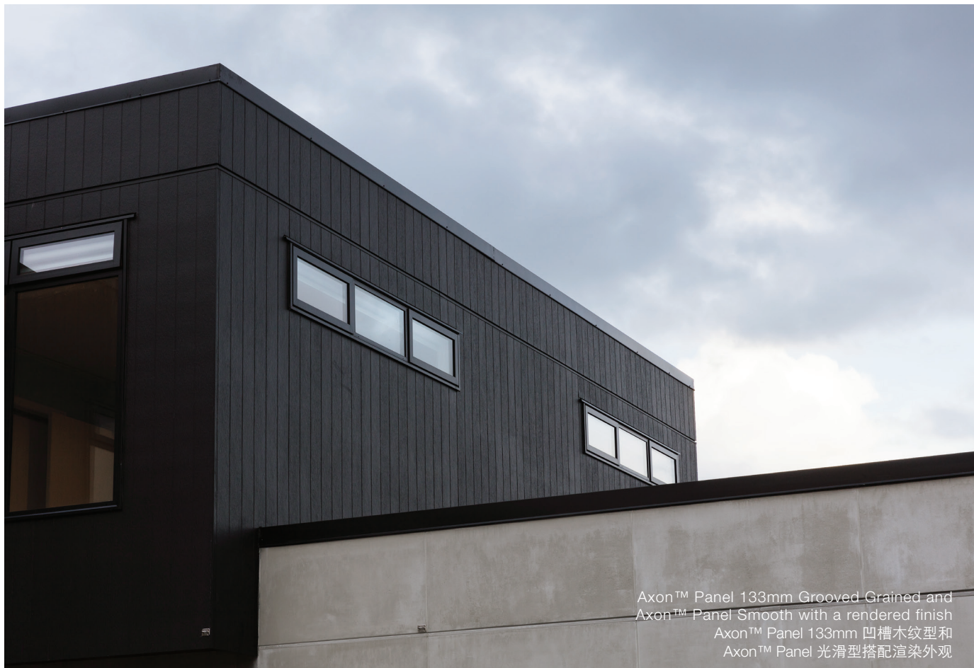
Axon™ Panel 133mm Grooved Grained and Axon™ Panel Smooth with a rendered finish Axon™ Panel 133mm 凹槽木纹型和 Axon™ Panel 光滑型搭配渲染外观