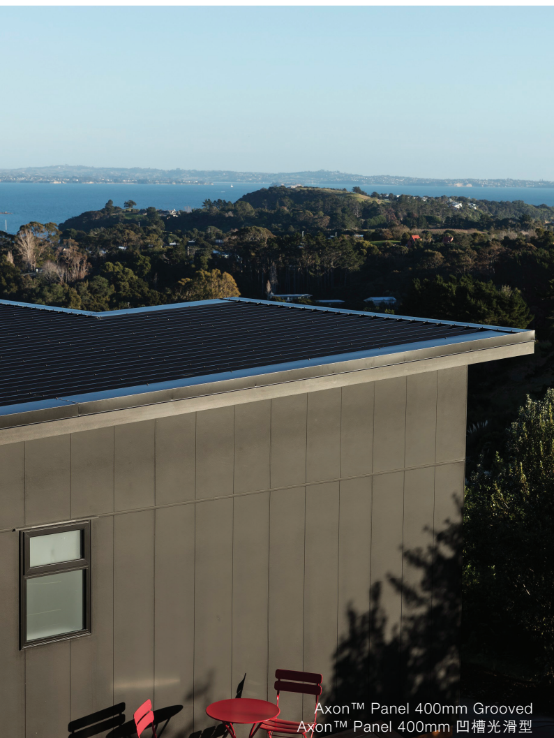
Axon™ Panel 400mm Grooved Axon™ Panel 400mm 凹槽光滑型