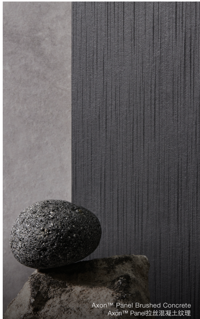
Axon™ Panel Brushed Concrete Axon™ Panel 拉丝混凝土纹理